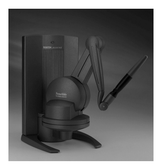
Figure 1. While users held the pen-like stylus (on the right) performing writing-like movements, the attached force-feedback mechanism generated a resisting force—haptic stimulation. Users responded by pressing a button on the stylus.

can affect the entire event to be experienced as richer, more complete, and coherent. Faster processing at the initial perceptual stage (at the first 250–400 ms) allows users more time in the consequent cognitive stages, enabling them better integration and filling in of missing information. Thus, at the end of the cognitive process, this richer experience may contribute to the greater sense of presence.